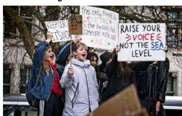
Global Climate Strike Protest in London, UK

has also taken sexist undertones. Recently a lewd sticker of the activist being sexually assaulted was circulated by a local oil company in Alberta, Canada.