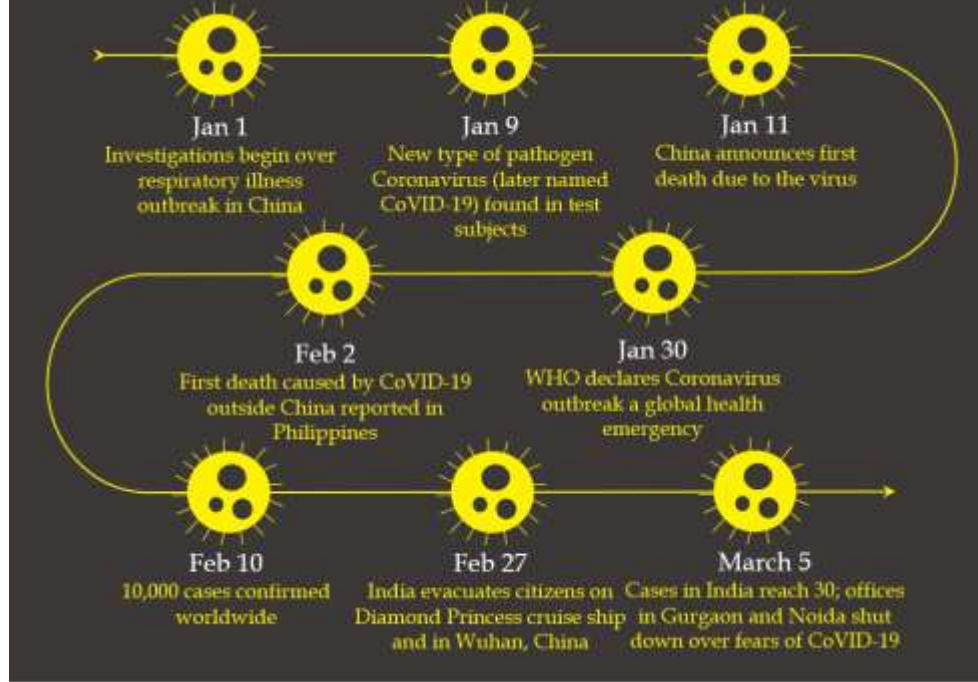
A Timeline on Coronavirus

As of 5 March 2020, the total number of cases has neared 30 after an Italian tourist in Jaipur and an Indian employee of Paytm who had travelled to Italy showed symptoms and were tested to be positive. The two have caused the number of cases to go up to 29 with the Paytm offices of Gurgaon and Noida giving leave for 2 days.