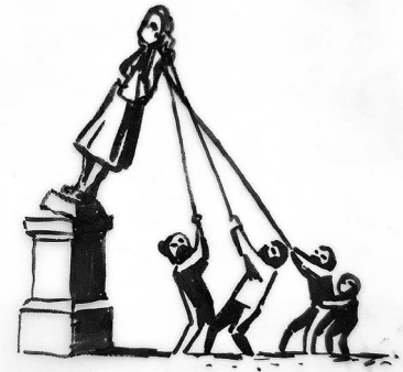
Banksy's reimagining of the Colston statue in Bristol

Banksy's reimagining of a bronze statue in Bristol had cables tied around the neck of